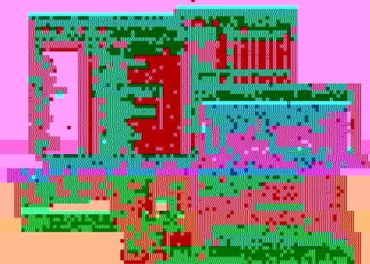
Fig. 10.2 HCI is a tool to analyze the HCI, and specify relevant characteristics of view to help the design of the HCI-based control system objectives.

Fig. 10.1 Closed-Loop System for automatic control. Ability to rely on human abilities and limitations for effective supply to user of control and performance.