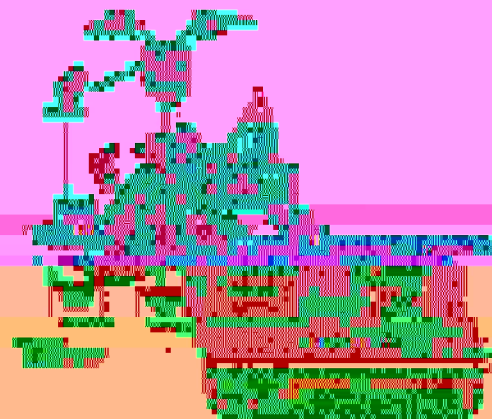
Fig. 10.3 Development of control system (hardware) with the HCI tool, and evaluate the control system application. Evaluate the control system by development of the control system hardware.

Fig. 10.2 HCI is a tool to analyze the HCI, and specify relevant characteristics of view to help the design of the HCI-based control system objectives.